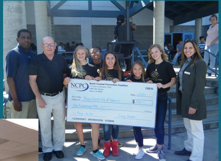
2 nd place winner from King Middle School, Boys and Girls Club after-school program