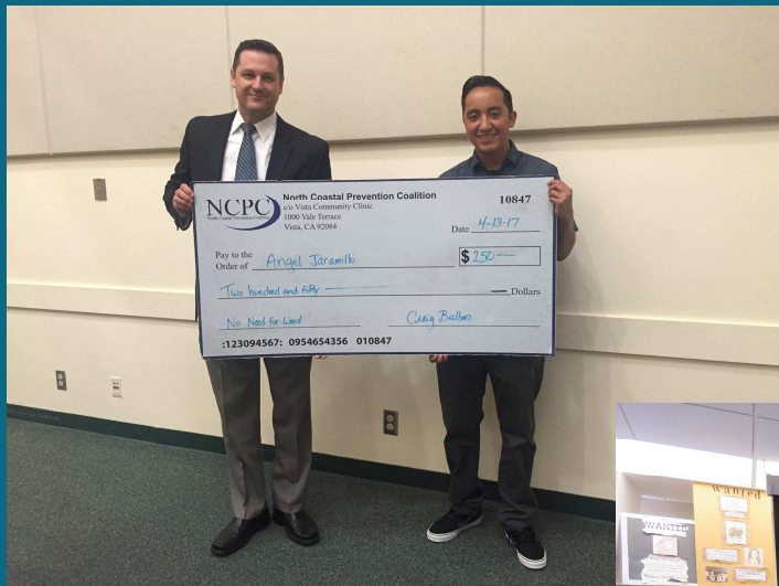
1 st place winner from Oceanside High School