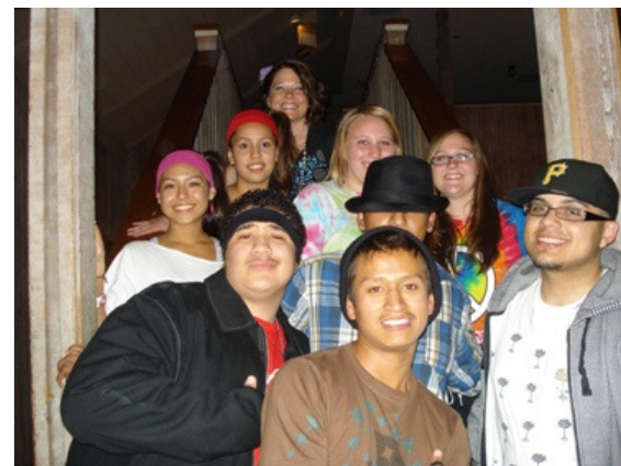
NCPYC at the 80's themed MADD Recognition event in December 2009

NCPYC members participated in the Mothers Against Drunk Driving (MADD) Youth in Action recognition event which celebrated the efforts of young people who work to prevent underage drinking. They were able to meet other like-minded young people in San Diego County who are committed to substance abuse prevention, and enjoyed a wonderful night of food, dancing, and fun!