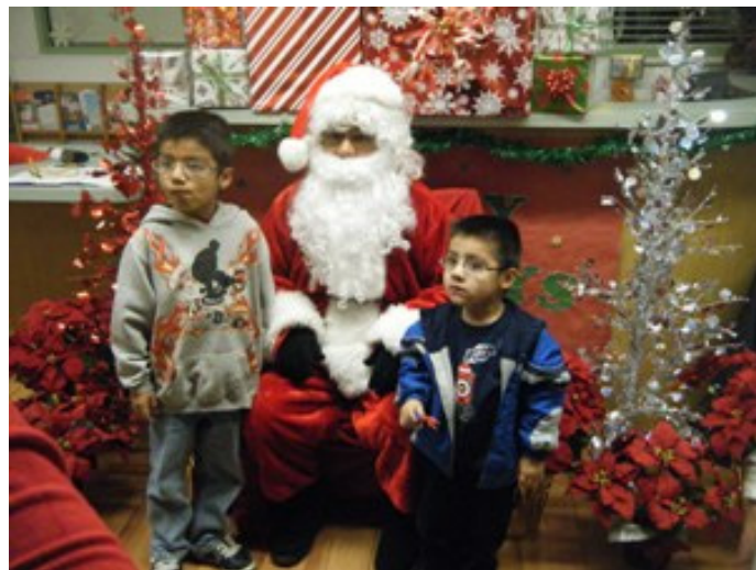
ENA children take a picture with Santa during 2nd Annual La Posada 2009

they were also mentioned as a strategy to increase safety in the neighborhood (95%). This year will be another busy year for the association members since they are adding more tasks to continue improving the increased safety and promote healthy activities for the youth. Some of the new events planned in 2010 include a soccer and football clinic, community clean-ups, and a march against crime.