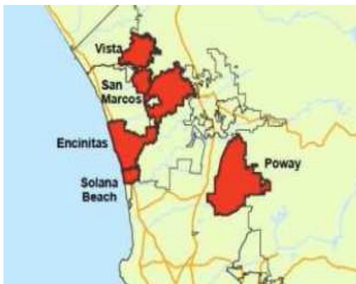
Cities in North San Diego County that require responsible alcohol sales and service training (Encinitas, Poway, San Marcos, Solana Beach, Vista).

At the local level, some cities have passed a Responsible Beverage Sales and Service (RBSS) ordinance mandating the employees of alcohol-licensed businesses to complete RBSS training, e.g., an ABC-certified LEAD training.